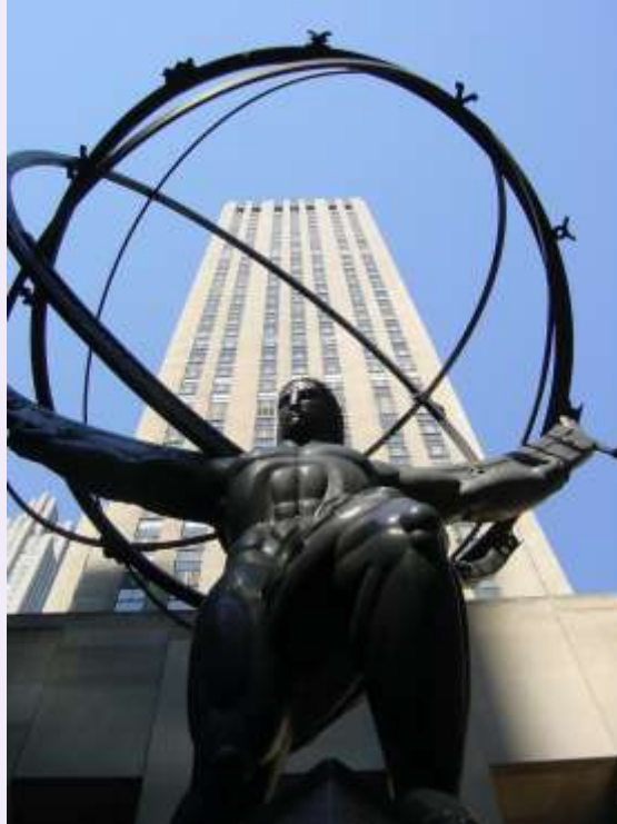
Atlas Statue, New York