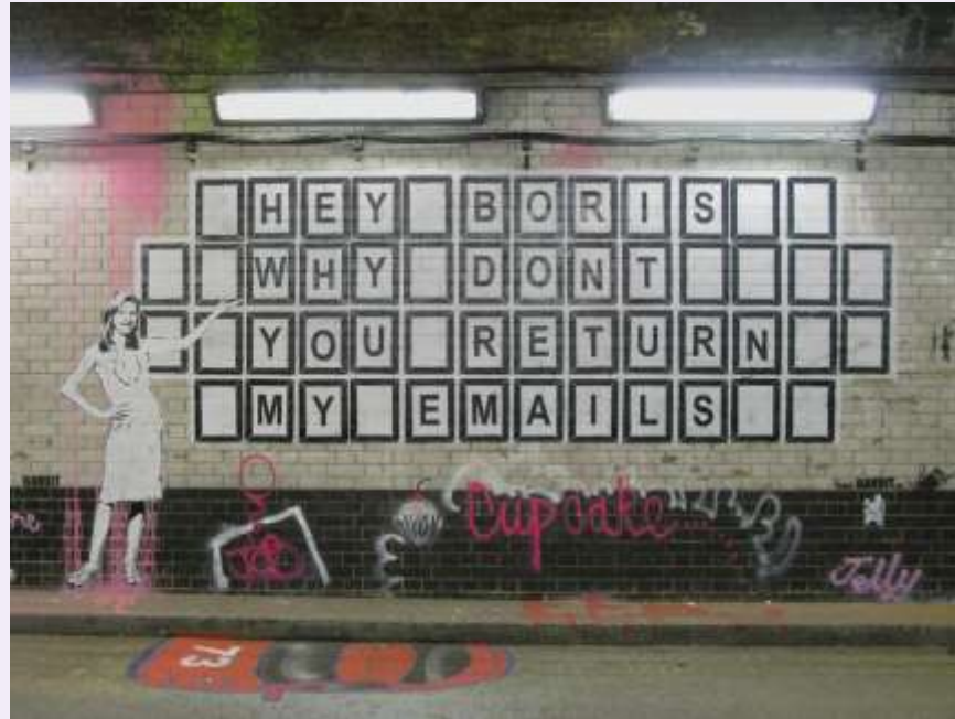
“The Cans Festival, Graffiti”

ASP.NET Web apps with SQL back ends are a “no brainer”.